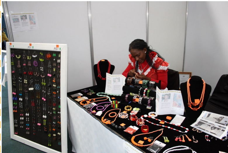
A woman entrepreneur displaying her wares

Botswana commemorated the International Women's Day in Molepolole village on 5 March 2015, under the localized theme of "Beijing +20: Where Are We?". This was an opportunity for the country to show its progress in support of women's empowerment. This year, 2015, the 20th anniversary of the ground breaking Beijing Declaration and Platform for Action, Botswana like many countries assessed progress towards achieving gender equality and women's empowerment. The Botswana's Beijing +20 Report notes that a lot has been achieved in the critical areas but more needs to be done to achieve gender equality and women's empowerment.