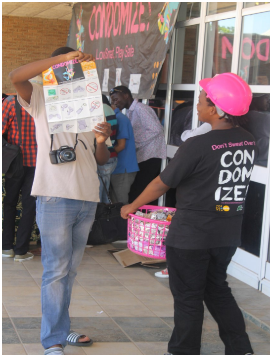
A university student learning about condoms during the campaign.

The Universities of Botswana, Lesotho and Swaziland held the intervarsity games from 8 – 13 March 2015 in Gaborone under the theme “We are here to grow; responsibility starts here” . The games brought over 1 400 students from the three universities to participate in various sports. In previous intervarsity games it was concluded that there was increased risky behaviours during the games, as evidenced by increased STIs, violence and rape during the games.