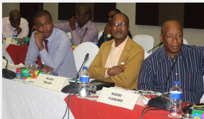
Ntlo Ya Dikgosi members at the briefing

Recognizing that traditional leaders and traditional structures are an influential force among a large majority of communities in the country, UNFPA accepted the invitation to brief the house of chiefs as part of orientation at the opening of the 3rd Session of the 10th Ntlo Ya Dikgosi. Speaking at the briefing, UNFPA Assistant Representative said the session was important as development and improvement of people's lives can only happen with the involvement of traditional leaders who she described as community role models on whom the people rely on. "The institution of Dikgosi is seen as vital in addressing gender inequality and GBV