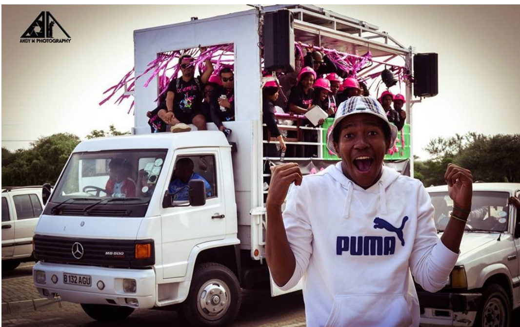
Celebrate with us! CONDOMIZE! Team in action.