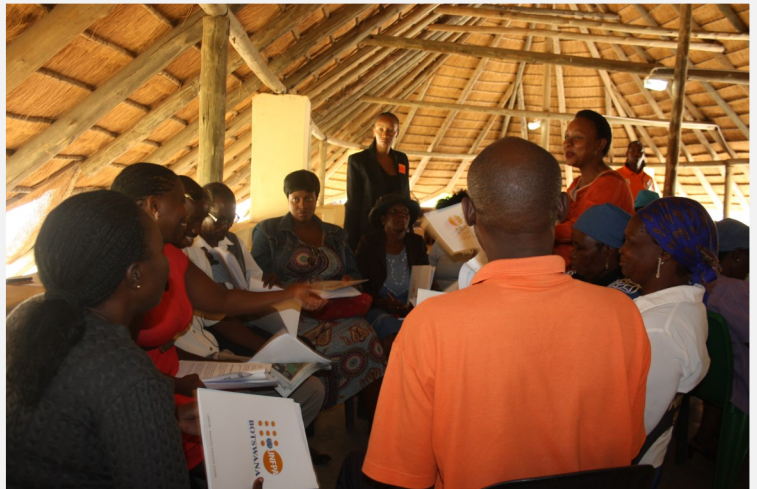
VDC members taking part in the case study on GBV.

The workshop, organized and facilitated by IkaGE Gender Network, was held at the Mogoditshane Kgotla on the 25 February 2015 as part of the Orange Day campaign . It educated the VDC on GBV, the Domestic Violence Act of 2008, and highlighted the role of the VDC in prevention and response to GBV. Empowering the VDC with GBV education is important in community awareness of GBV.