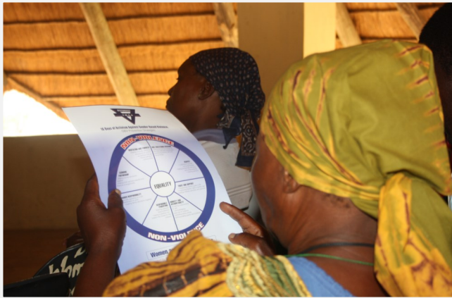
A participant at the meeting reading about GBV

As part of its commitment to eliminating gender based violence (GBV), UNFPA supported a sensitization workshop on GBV targeting the Village Development Committee (VDC) in the village of Mogoditshane. UNFPA identifies the role of community-based structures as critical in addressing GBV. As GBV stems from unequal power relationships within families, communities and between men and women, interventions that seek to prevent or respond to GBV are most effective when they challenge inequitable norms and practices through community engagement. The VDC is pivotal in addressing GBV as they have influence and are in contact with the community members to raise awareness on GBV. They are also strategic in identifying cases of abuse and making the necessary referrals. The VDC also works in close contact with structures like the Botswana Police Service, Religious Leaders, Crime Prevention Units and traditional leaders (chiefs) and can therefore engage with these to prevent and respond to GBV.